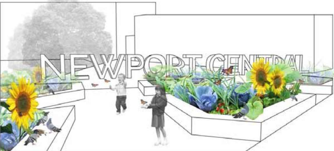
WALL CLIMBING VEGETATION